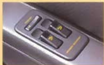
Convenient electric windows.