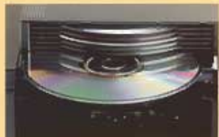
Remote change CD player is an option.