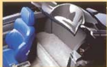
Large luggage area under Capote lid.

is fitted. It features an AM/FM radio cassette player with Dolby, music search, auto store and security coded anti-theft protection.