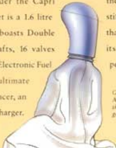
Gear selector. A short-throw gear lever and shaped knob make changing gears a sporting delight.

The heart of any sports car is its engine. Under the Capri Clubsprint's bonnet is a 1.6 litre power plant that boasts Double Overhead Camshafts, 16 valves for rapid gas flow, Electronic Fuel Injection and the ultimate performance enhancer, an intercooled turbocharger.