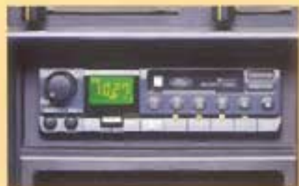
High performance Alpine stereo.